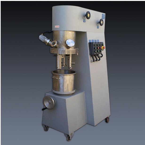
PDP Planetary Mixer with Tank Lifting Device