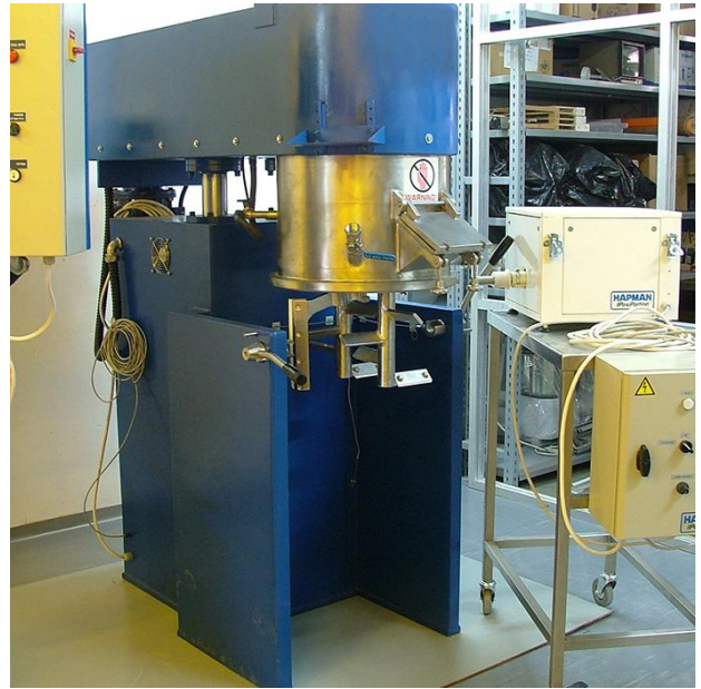
Special PDP Mixer with Bolted Blades