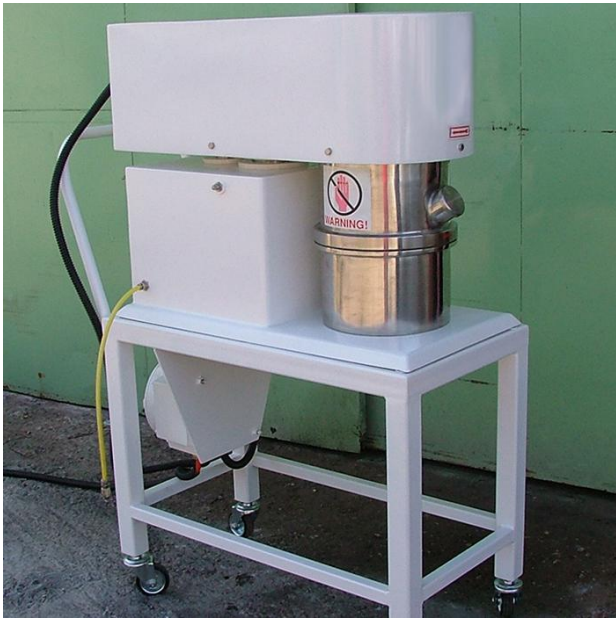
Lab Size PDP Double Planetary Mixer