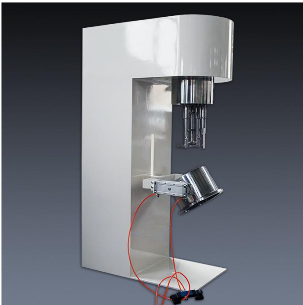
PDP Mixer with Pneumatically Tiltable Tank