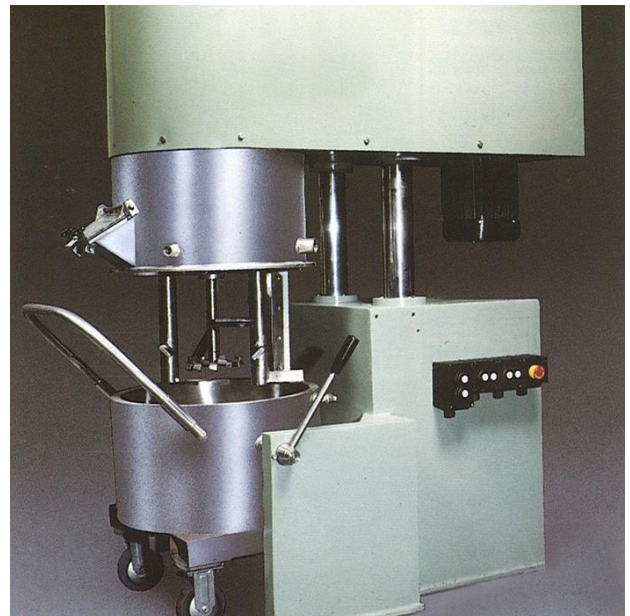
Double Planetary Mixer with Removable Tank