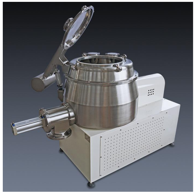
PDI-600 with Special "Half Lid"