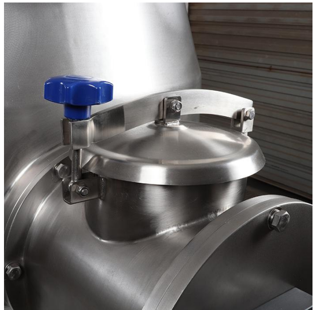
Access Door of the Discharging Housing