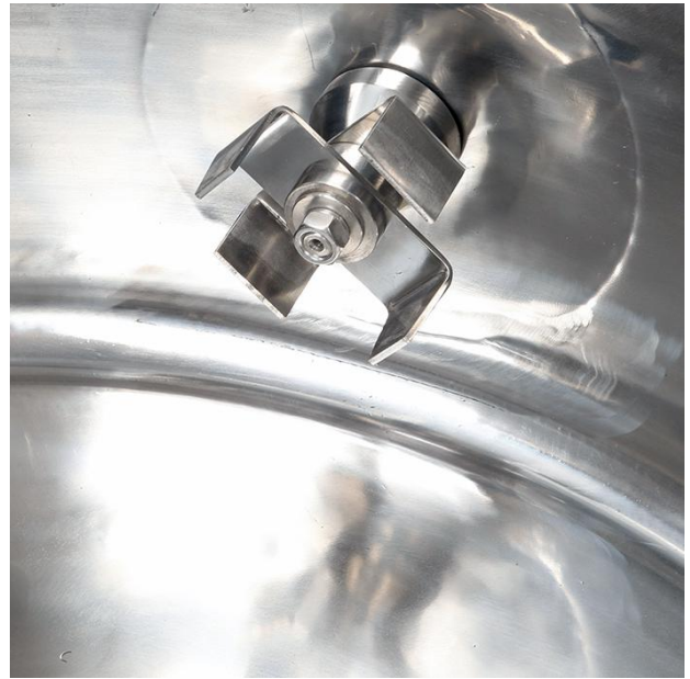
High Speed Chopper of PDI Mixer