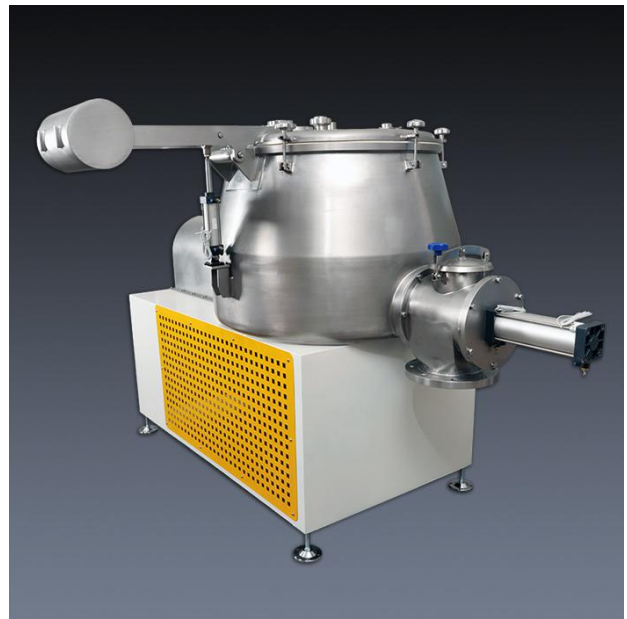
PDI-600 Cover Closed with Counterweight