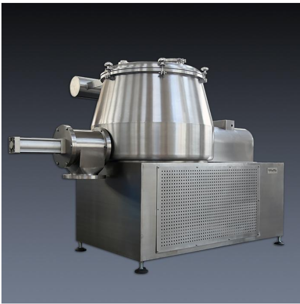
PDI-600 Mixer Built in All Stainless Steel