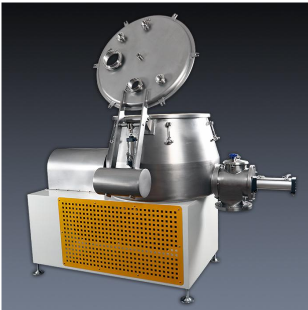
PDI-600 Cover Opened with Counterweight