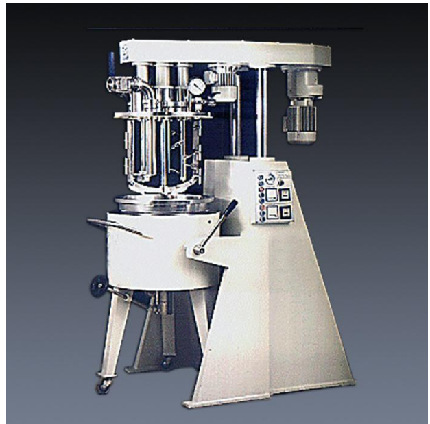
PMS Vacuum Mixer with Lifted Mixing Tools