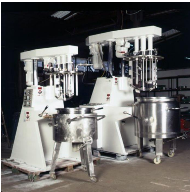
Two nos of PMS Vacuum Mixer