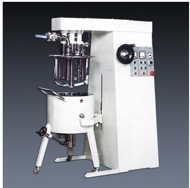
PMS Mixer by Manually Lifting