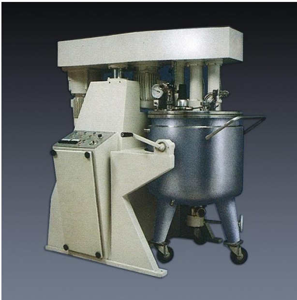
PMS Vacuum Mixer with Movable Vessel