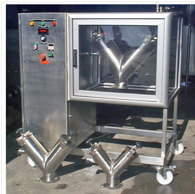
Special Design with Interchangeable Vessels