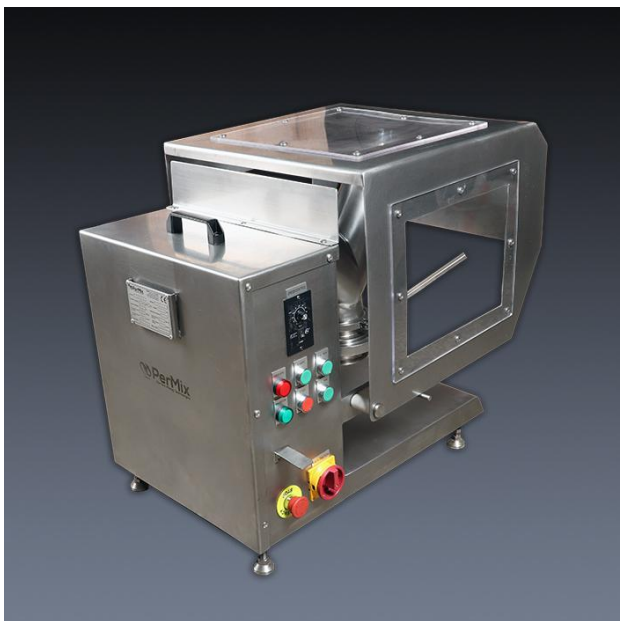
PVM-5 Mixer with Electric Control Panel