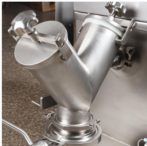
Vessel of PVM Mixer