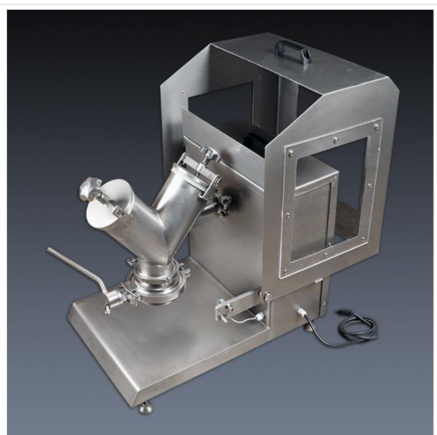
Lab-size PVM-5 Mixer