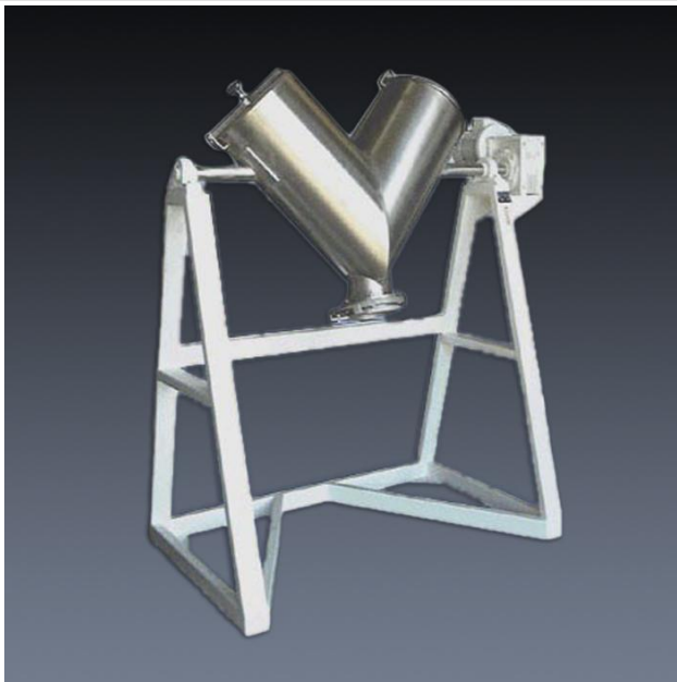
Standard PVM V-shaped Mixer