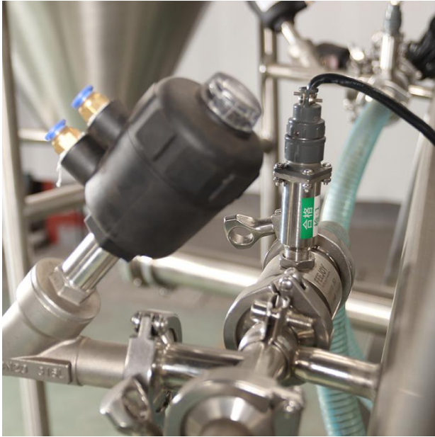
Flow Meter to Control Liquid Adding