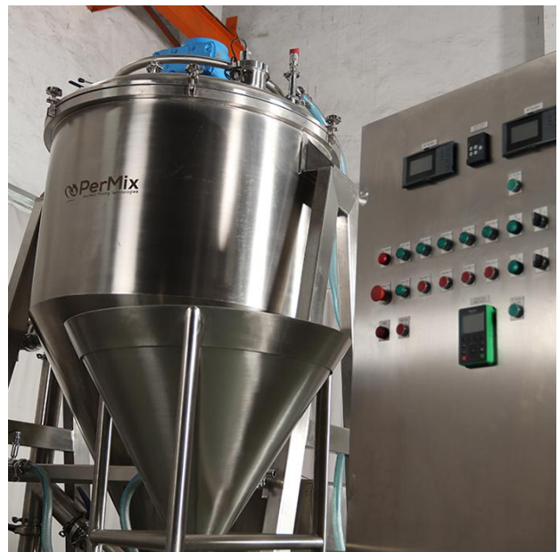
PVC-1000 Mixer with Electric Control