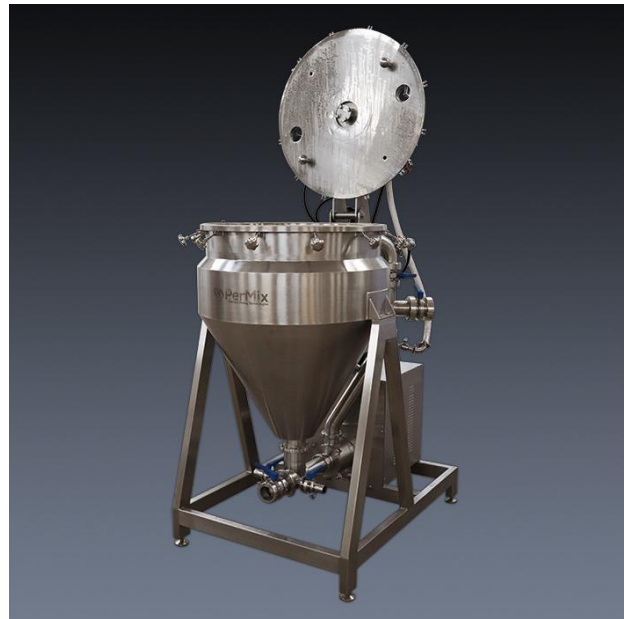
PVC Mixer with Open Cover