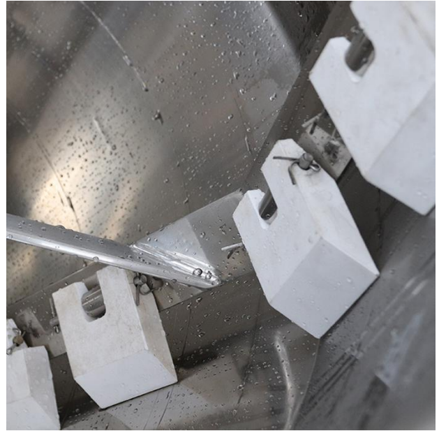
Anchor Mixer with Scrapers of PVC Mixer