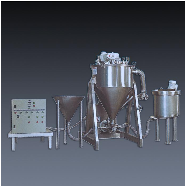
PVC Vacuum Emulsifying Mixing System