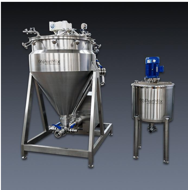
PVC-500 Mixer with Pre-Mix Tank